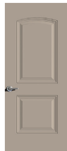
2 panel archtop